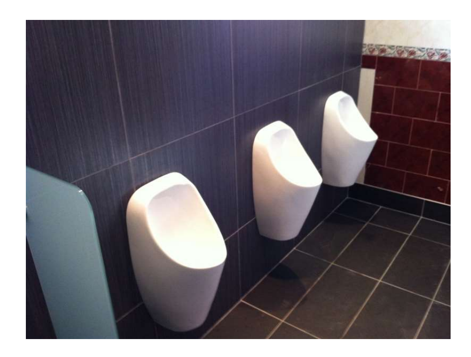
URIMAT ceramiccompact (discontinued)