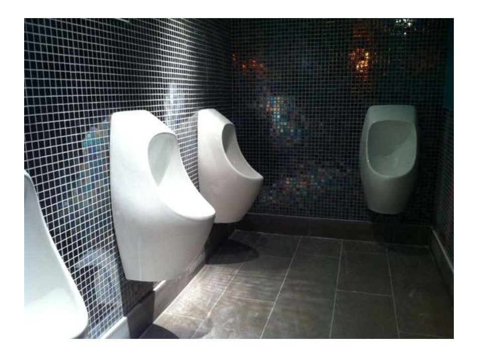
URIMAT ceramic (discontinued)