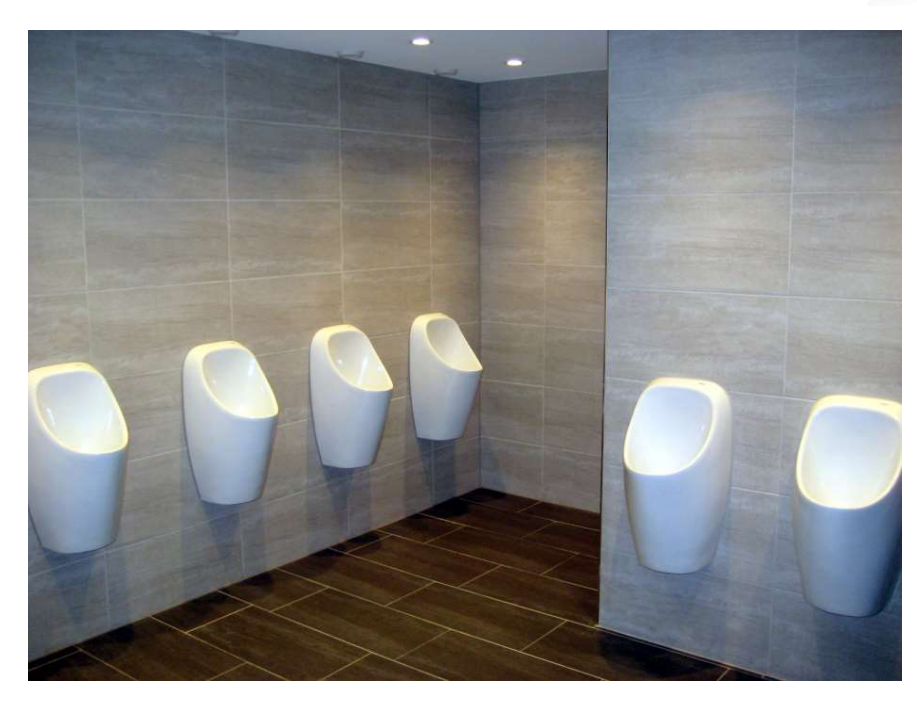
URIMAT ceramiccompact (discontinued)