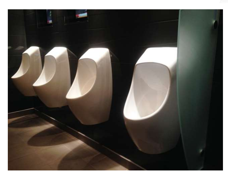
URIMAT ceramic (discontinued)